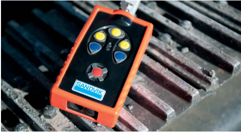
Remote control for ease of mobility