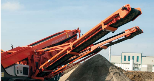
Hydraulic slew and raise / lower facility