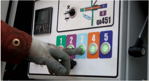
Colour coded control panel for ease of operation