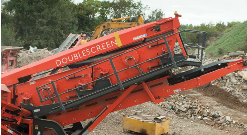
Patented triple deck Doublescreen technology