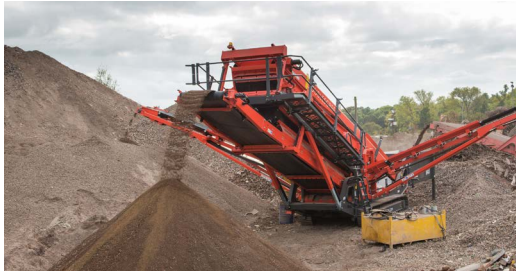
Massive stockpiling capabilities