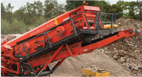
Hydraulically folding walkways for ease of maintenance