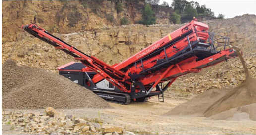
Massive stockpiling capabilities