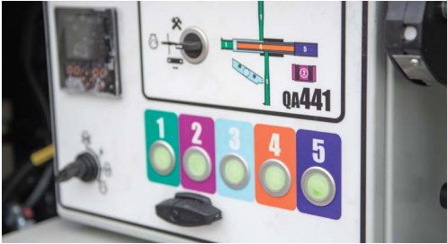
Colour coded control panel for ease of operation