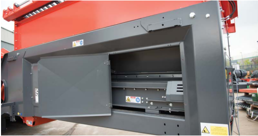
Redesigned feeder hopper for easier access