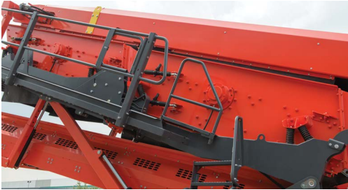
Patented double deck Doublescreen technology