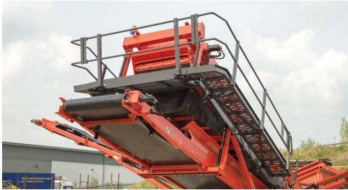
Three sided walkway around main conveyor