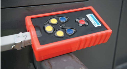
Remote control for ease of mobility